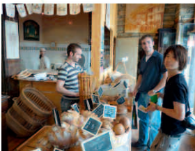
In a typical French bakery