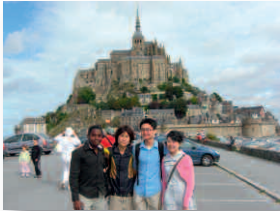
Mont Saint-Michel UNESCO World Heritage