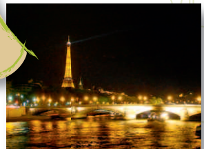
Paris and the Seine River