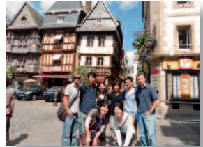
Medieval houses in Lannion